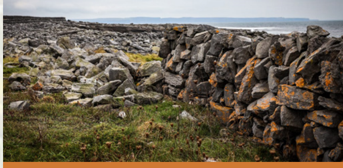
STONE WALL REPAIR.

As the maintenance of stonewalls is a priority particularly on the Aran Islands, and if farmers have not availed of the 'Traditional Stone Wall Maintenance' general action at the start of the scheme, they should consider adding in suitable walls in the 'Repair of Traditional Stone Wall' NPI option on the Annual Works Plan, with different walls selected each year.